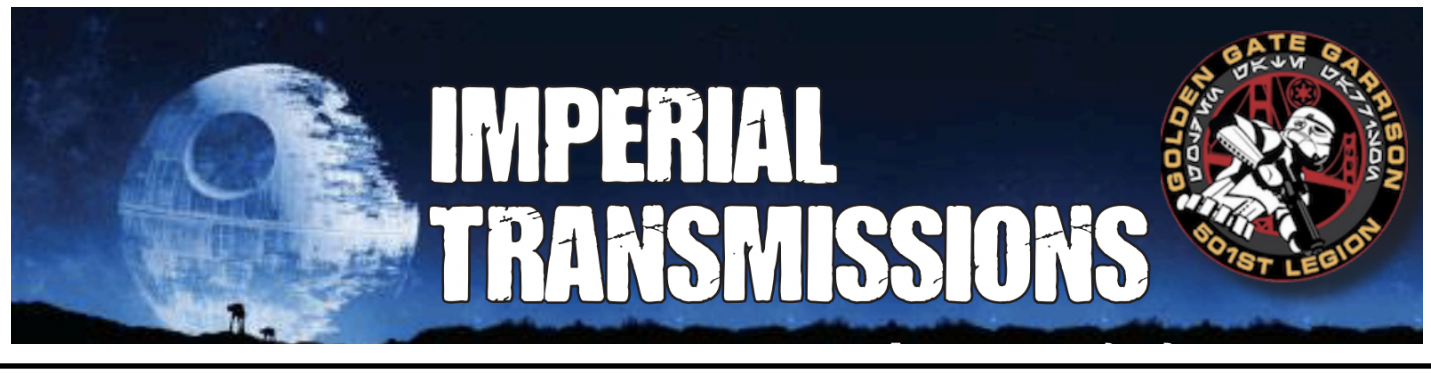
April 2021- Golden Gate Garrison Member Newsletter